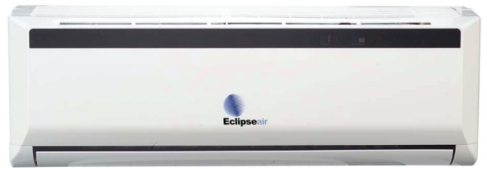
MSC-09HRDN1, MSC-12HRDN1, MSC-18HRDN1, MSC-21HRDN1, MSC-24HRDN1